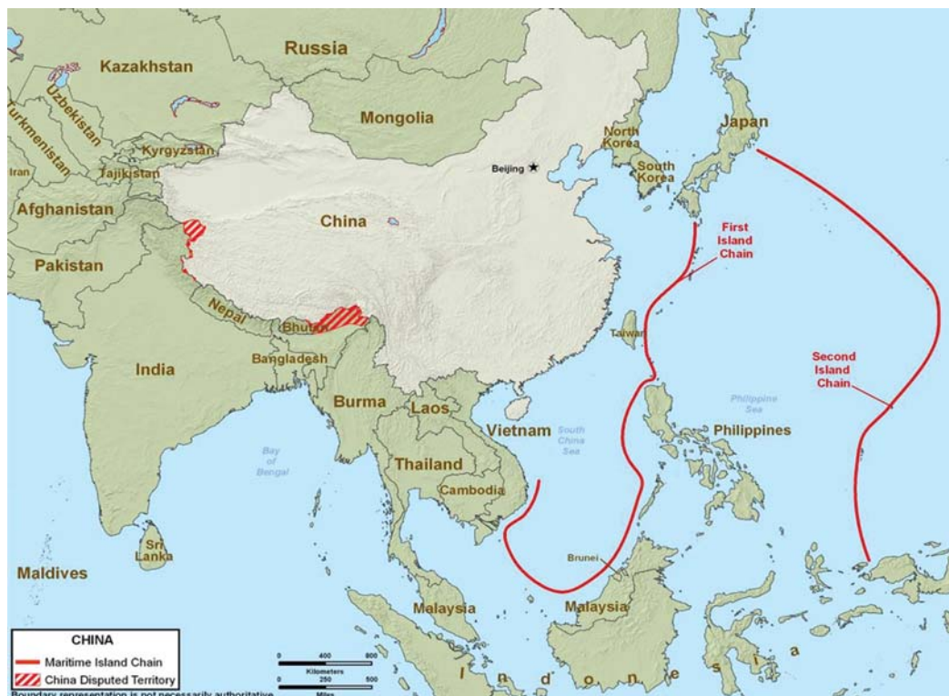
Figure 2: China’s first and second maritime lines of defense