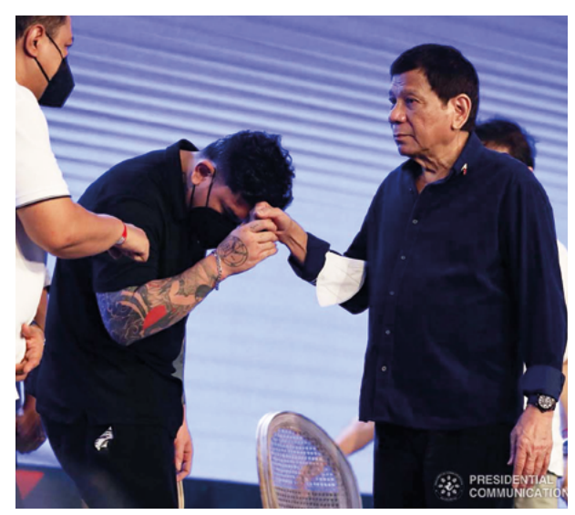
A matter of family: President Rodrigo Duterte with his son, mayoral aspirant Sebastian "Baste" Duterte in Davao City on May 6, 2022.

When discussing the use of deadly force in crime control, various factors are commonly considered, ranging from crime levels to organizational culture. Often overlooked is the influence of politics, especially local politics, on police use of deadly force, even though this may provide an important explanation for spatial and temporal variation within states. Using the Philippines as a case study, I contend that local political executives can strongly impact local police use of force levels.<sup>1</sup>