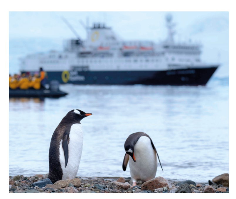
Danco Island, Antarctica: The small island in the Errera Channel is a landing spot for tourists and home to a Gentoo penguin colony.

Antarctic diplomacy has famously shielded the continent of peace, science, and environmental protection from outside conflict and war. This "exceptionalism" is now being tested by Russia's war against Ukraine and the belief that international strategic competition between great powers is spilling over into the Antarctic. In order to keep the Antarctic exceptional, however, it would be wise to refocus on what has made Antarctic diplomacy so successful in the first place: cooperation in order to compete, or "co-opetition."