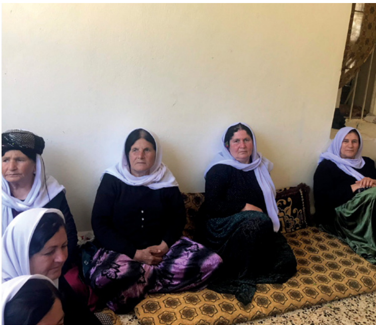
Yezidi women from different parts of the Kurdistan region, mostly from Lalish and Şengal but also some visiting from Germany, waiting for the daily communal lunch in the holy Yezidi temple Lalish. (Photo: © Rosa Burç).

As the international memory of ISIS' genocide against the Yezidi population of Şengal in Northern Iraq recedes, its victims have been left to languish increasingly hopelessly, in refugee camps with little realistic prospect of returning to their homes. Tens of thousands of displaced Yezidis remain dispersed across Northern Iraq, hundreds of kidnapped Yezidi girls and women are unaccounted for and the fates of many of their male relatives unknown. In the short term, there is an urgent need for international protection from further attacks, the recognition of a political status for Şengal and immediate aid for refugee camps to create the conditions for Yezidi genocide survivors to return, resettle and gain a sense of political stability and empowerment.