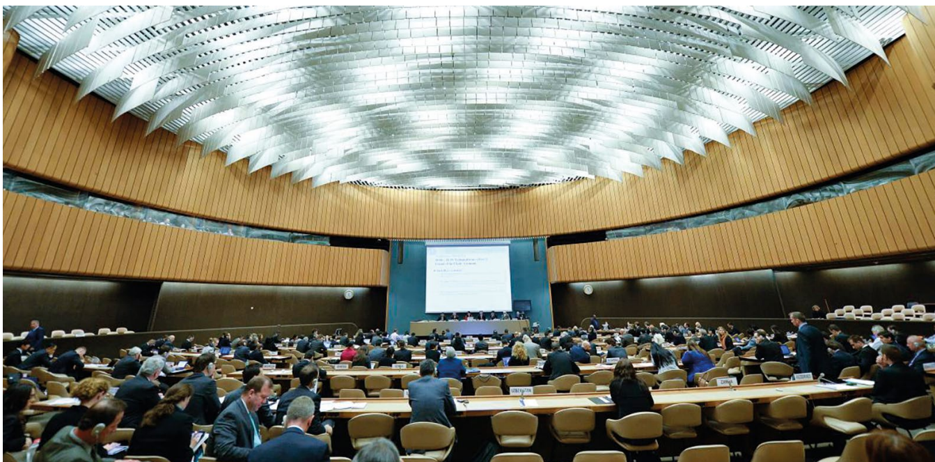
UN Geneva - CCW Informal Meeting of Experts on Lethal Autonomous Weapons Systems, 14 May 2014

The CCW has fulfilled its originally envisioned role as a flexible instrument through the adoption of new protocols. Its preamble has so far never been amended, but the general procedures for amendments laid out in CCW Article 8 (1)(a-b) apply: Every party may propose amendments to the Depositary, who will then determine whether a majority of the contracting parties agrees to conduct a conference to discuss the amendment. However, considering the budgetary constraints, an additional conference is not necessarily needed. Instead, according to Article 30 of the CCW Rules of Procedure, amendments can also be submitted to the Chair of the Conference and discussed in one of the regular meetings.