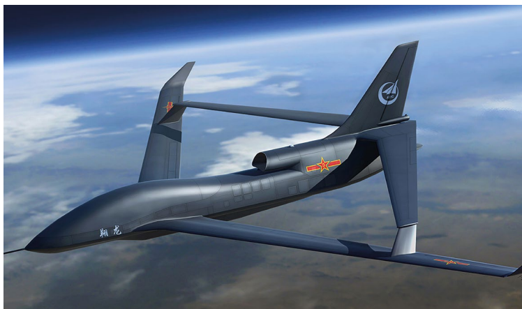
A Chinese military drone, remotely piloted. How can human control for all weapons be preserved?

We are, once again, witnessing a technological revolution in warfare: the progressing autonomy in weapons systems. Autonomy refers to capabilities of weapons to operate without human guidance, pertaining to less controversial functions such as navigation and reconnaissance – but also to the alarming prospect of robots making the killing decision. The latter in particular has given rise to fundamental ethical and legal concerns: To what extent is it morally acceptable to use robots in military operations? Are autonomous weapons capable of compliance with International Humanitarian Law? Who can be held accountable for their actions and how? Responding to these concerns, this Spotlight echoes the calls for a ban on killer robots, and proposes to adopt a new principle, which would turn meaningful human control of lethal weapons into an obligation under International Humanitarian Law.