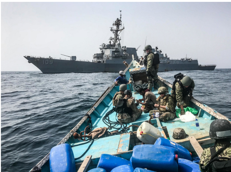
U.S. Navy Seizes Weapons in Gulf of Aden (Photo: U.S. Naval Forces Central Command (NAVCENT) Public Affairs | Public Domain; The appearance of U.S. Department of Defense (DoD) visual information does not imply or constitute DoD endorsement).

Since the outbreak of the war in Yemen in 2015, the state has seen a growing influx in the supply of weapons. These weapons are both legally and illegally provided by regional and international powers to all major factions of the conflict. While arms transfers and their effects on the conflict in Yemen have received considerable attention, a lesser known fact is that weapons are increasingly circulating between Yemen, Somalia and Djibouti – the three states adjoining the Gulf of Aden. Against this background, this text shines the spotlight on weapons flows dynamics in a highly militarized region.