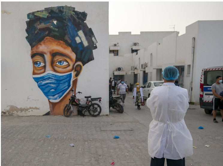
A view of Covid-19 patients in Ibn Jarrah hospital at quarantined Kayravan province of Tunisia, Tunisia on June 22, 2021.

Soon after the global outbreak of the COVID-19 pandemic, concerns were raised about its potential to exacerbate violent extremism and radicalization. Based on the findings of a EuroMeSCo Policy Study and focusing on the Maghreb states, this Spotlight argues that while the pandemic undoubtedly had serious consequences, there is so far no empirical evidence of a direct “COVID effect” on the activities of violent extremists beyond references to the pandemic in propaganda. In light of this, the article makes the case for broadening the debate to also take more indirect aspects such as the states’ crisis management and the emerging socioeconomic consequences into account.